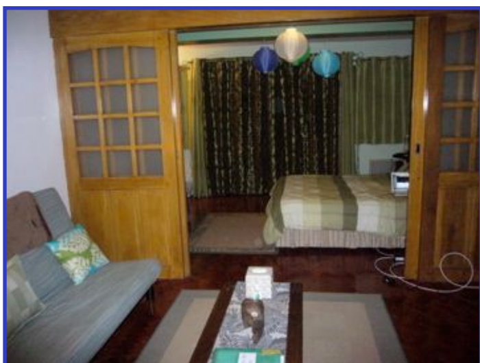
I found the perfect apartment that was nicely furnished. Praise God for his provision!

When I first did ministry in Manila on the Doulos over a year ago, I knew that working with local people was something I wanted to do again. I had my first chance recently when I was invited by a friend to participate in a medical ministry to a disadvantaged area of Manila. We showed up on Saturday morning with medical supplies and two doctors who volunteered their time. While the patients waited to see the doctors, they were able to hear the gospel; the reason we were all there. Though I knew nothing about prescriptions and didn't speak the language, I did my best and had a blast! It's true that love crosses all barriers. I even had a great bonding moment with a precious four-year-old girl who was my shadow all day. I praise God for opportunities like this and look forward to doing more!