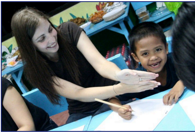
Turkey. Mashed Potatoes. Stuffing. Pie.

All things we associate with Thanksgiving. Though my day didn't include these items, it turned out to be just as nice. I went into the week feeling sorry for myself that my entire family would be spending the holidays together and that I would, most likely, be enjoying a bowl of easy mac for dinner on this special day. It was not how I wanted to spend my holiday, but I thought that's how it would end up. Thankfully, God had other plans.